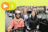
0.1 Intro Video